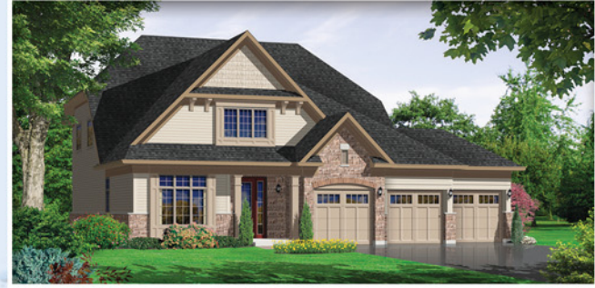
Bungalow Loft Elev-B -2293 sq.ft.