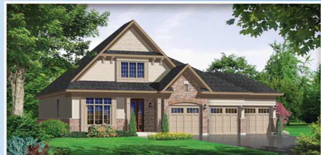
Bungalow Elev-B -1371 sq.ft.

The floorplans and elevations shown, dimensions, specifications and architectural detailing are pre-construction plans and may be revised or improved as necessitated by architectural controls and the construction process. All dimensions are approximate. Actual usable floor space may vary from the stated area. House may be reversed and purchaser agrees to accept the same. Specifications are subject to change without notice. Steps may vary at any exterior entrance. All illustrations are artist's concept. E.&O.E.