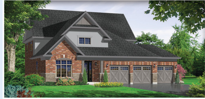
Bungalow Loft Elev-A -2296 sq.ft.