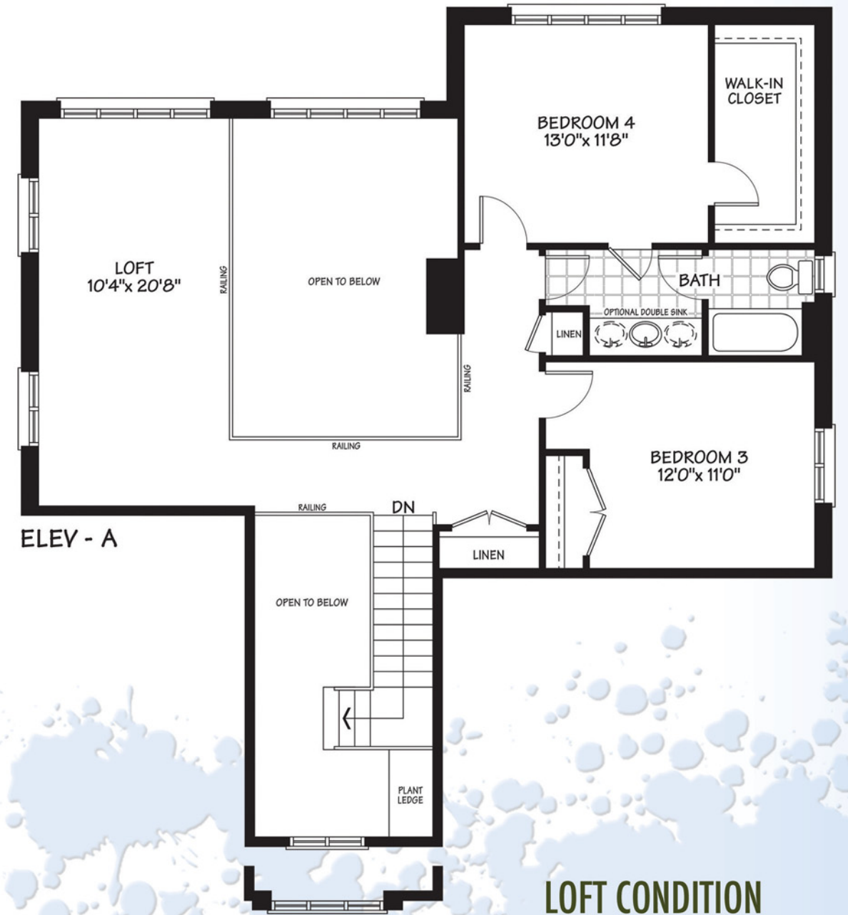
ELEV - A